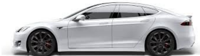
Tesla model S?